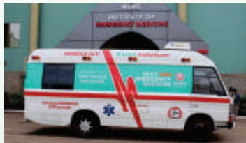
Mobile ICU D level Ambulance