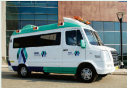
Mobile ICU D level Ambulance