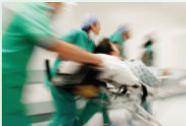
EMERGENCY TRAINING PROGRAMS